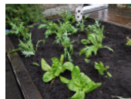
Bed 5 Onion family

We planted lots of winter lettuce and mizuna – a Japanese mild salad leaf. Very soon these can be harvested as a cut and come again crop and left to grow on to provide early salad crops next year.