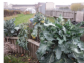
Bed 3 Cucumber family/Lettuce family

We planted lots of winter lettuce and mizuna – a Japanese mild salad leaf. Very soon these can be harvested as a cut and come again crop and left to grow on to provide early salad crops next year.